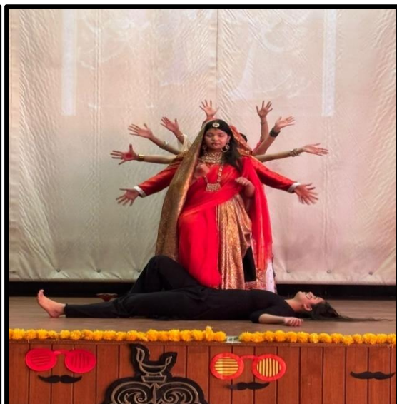
Navratri Festival Celebration (October 9, 2024)