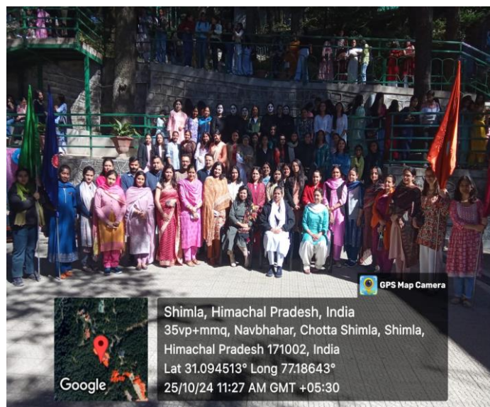
Students and teachers unite to promote “Green Diwali”