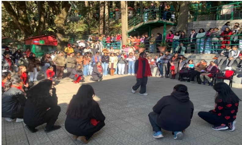
Students spreading awareness about gender equality, consent and dignity of women